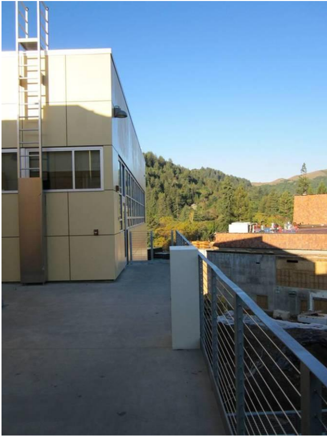
South Elevation 2 nd and 3 rd floor, existing condition