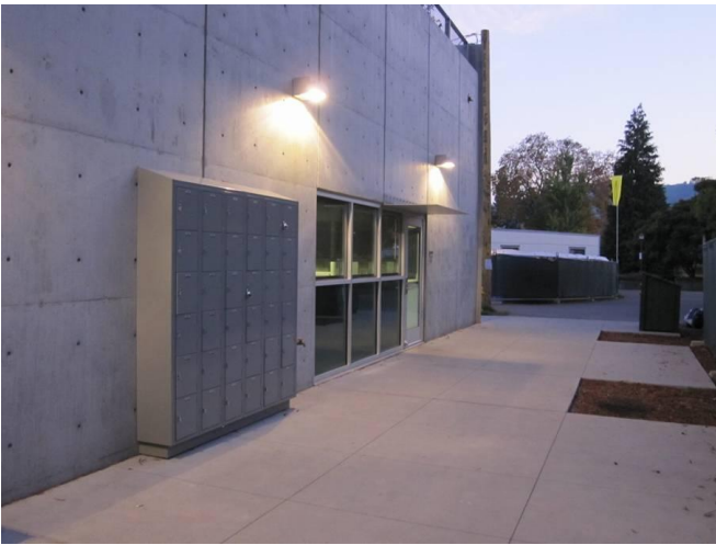
West Elevation, Ground Floor, existing condition