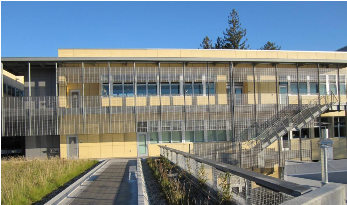
South Elevation 2 nd and 3 rd floor, existing condition