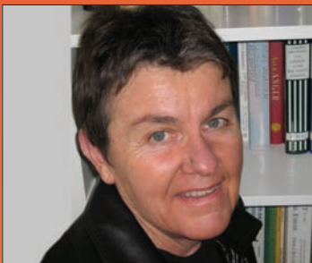
KAY RYAN Basic Skills Professor, Poet Laureate

Poet Laureate Kay Ryan has taught basic English skills at College of Marin for more than 30 years. Ryan's students are often serious, hardworking people in their late twenties or early thirties intent on improving the quality of their lives through learning. Without strong English writing and reading skills, well paying jobs and promotions elude them.